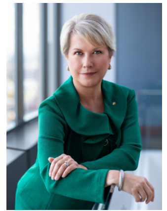
President Rotary International 2022-23